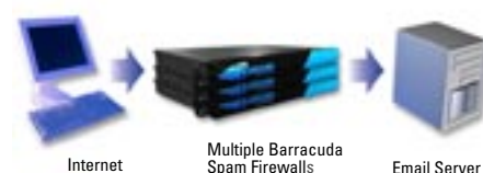
Clustering provides for redundancy and even greater capacity